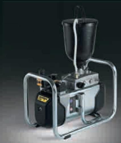
Double diaphragm pump